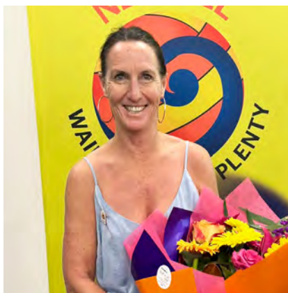
Dorothy Carr Service Award Recipient