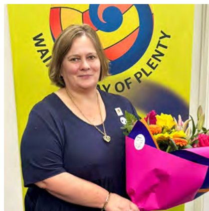
Belinda Clark Service Award Recipient