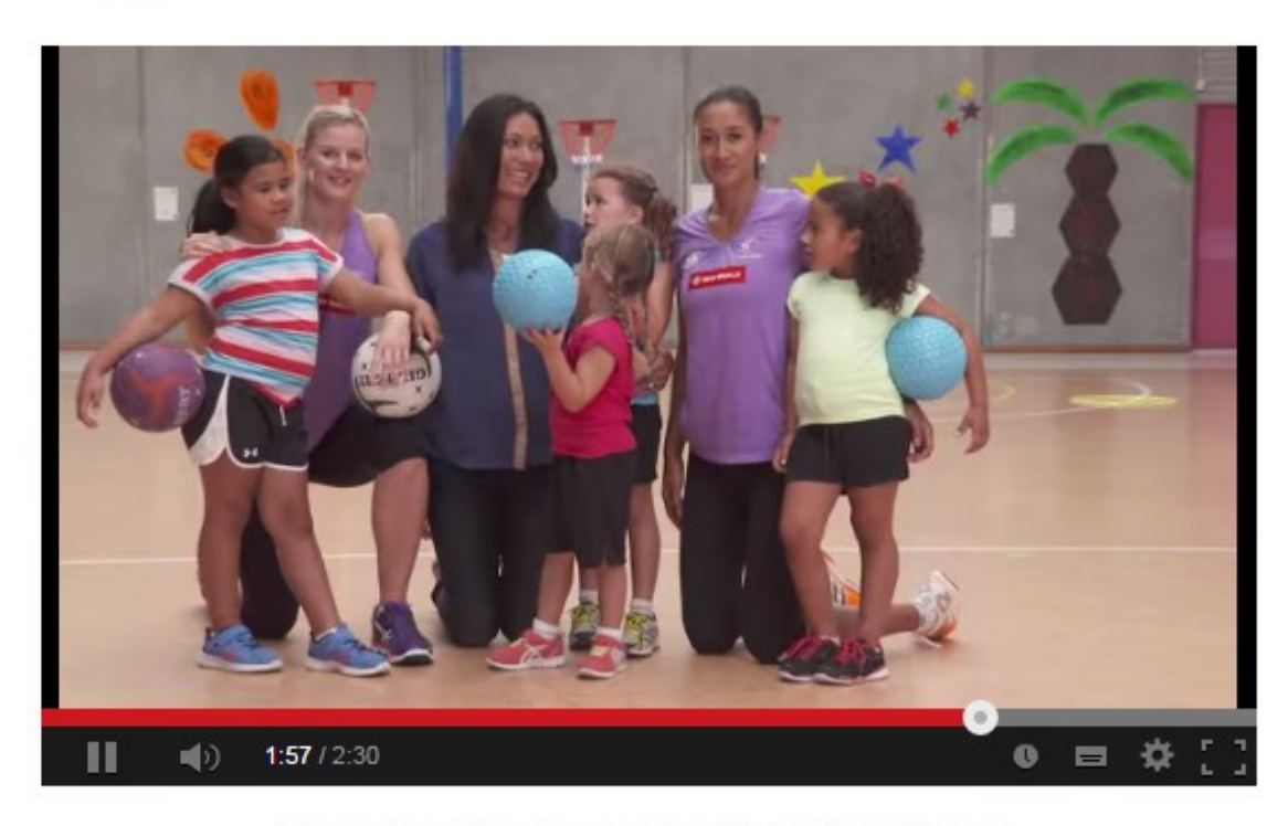
More Fun. More opportunities. More Space. The game grows with the players. More Passes. More Goals